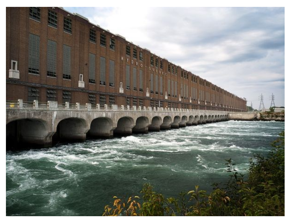
Hydro-Québec's Beauharnois generating station.

Traditional methods of determining the hydraulic response involved physical monitoring of water levels in the tailrace during a test load rejection. In this study, Hydro-Québec selected MIKE 11 to evaluate the feasibility of using a numerical model to estimate the water level response in the tail race due to a typical load rejection scenario.