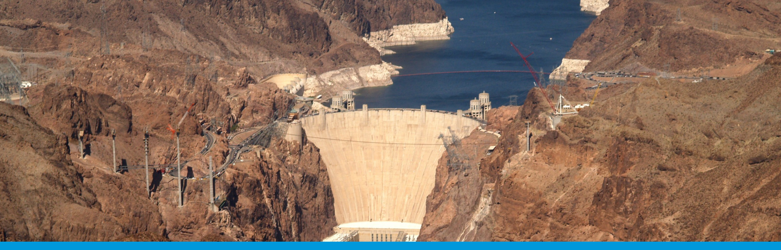
MIKE BY DHI CASE STORY